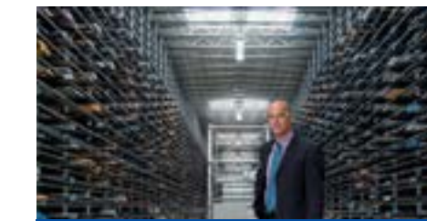
Non-Ferrous Metal Distribution

AMCO's wide range of services is almost unique in Europe